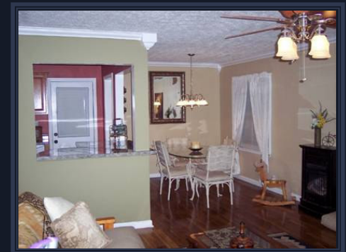
Fully furnished Corporate Housing